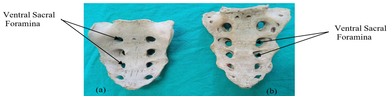
Fig 2: Pelvic surface of sacrum with complete non fusion of sacral